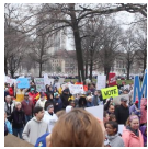
Saint Louis Marches for More Gun Control in the United States