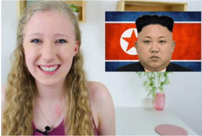
The Hood Report: North Korea Stopped Testing Nuclear Weapons