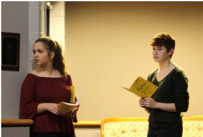
FHN Drama Club Spring Play Will Put on Two Shows in One Evening on April 12-14