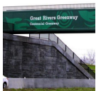
Ribbon Cutting for the Centennial Greenway Bridge on April 7